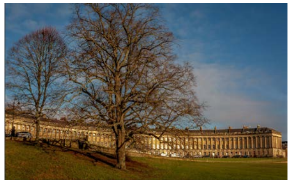
The Royal Crescent - Bath-2

16:15 Coach to campus and to collect baggage for departure