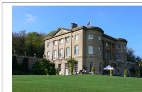
American Museum in Bath

17:30-19:30 Meet outside the Lime Tree Café. We will walk to the American Museum for our drinks reception in the Orangery and the following: