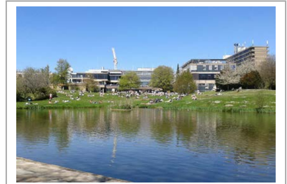
University of Bath

An introduction to creating podcasts using the digital editing tool Audacity. The talk will cover tips and tricks for making your recordings sound better and then take you through a live demonstration of editing and layering recordings to create audio guides and podcasts.