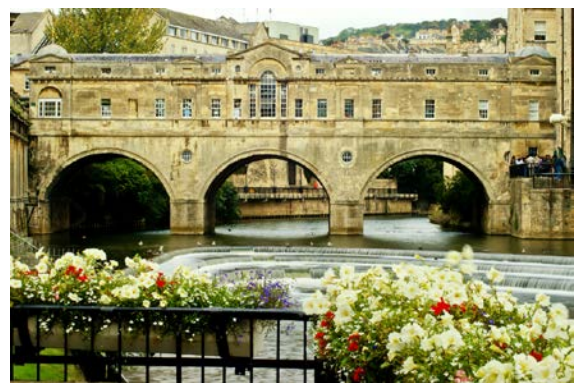
The weir, Bath.